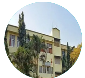
TATA Institute of Social Science