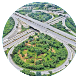
Outer Ring Road (ORR)