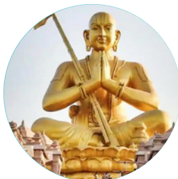
Statue of Equality