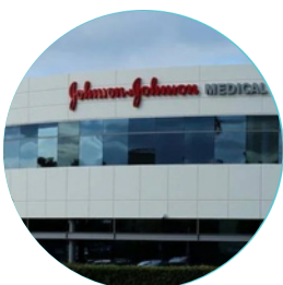
Johnson & Johnson